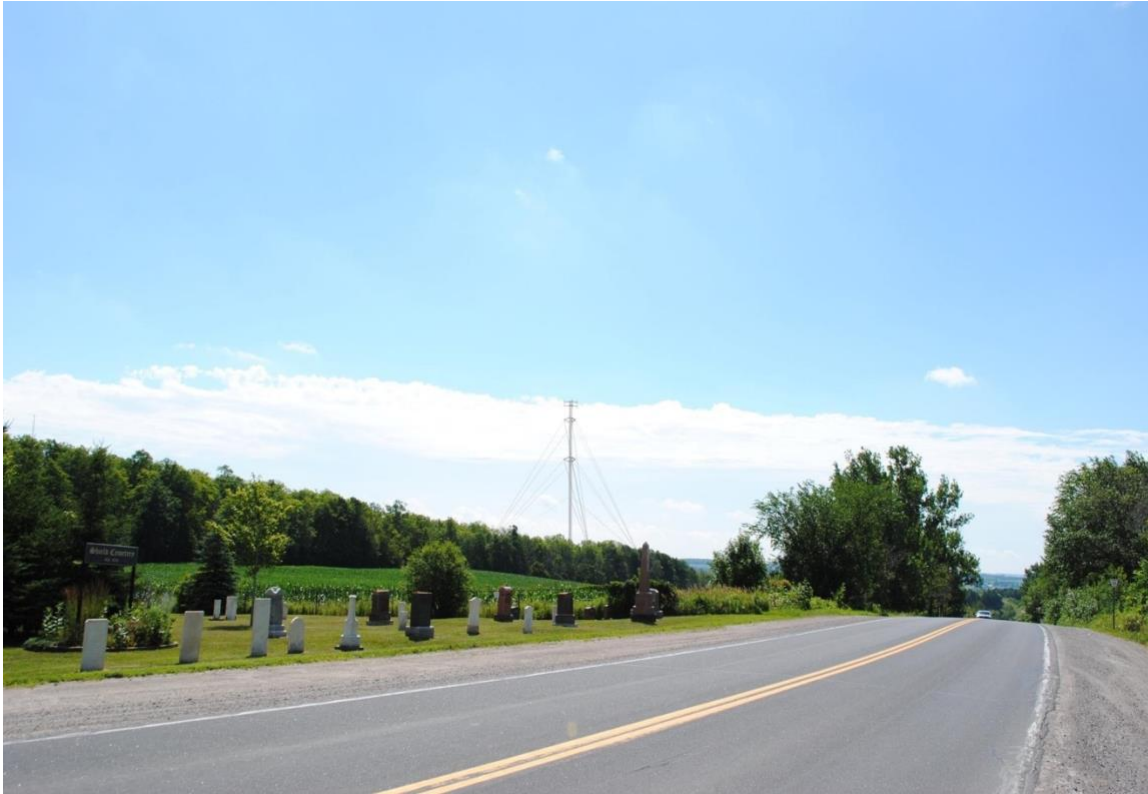
Figure 3 – Photo Simulation