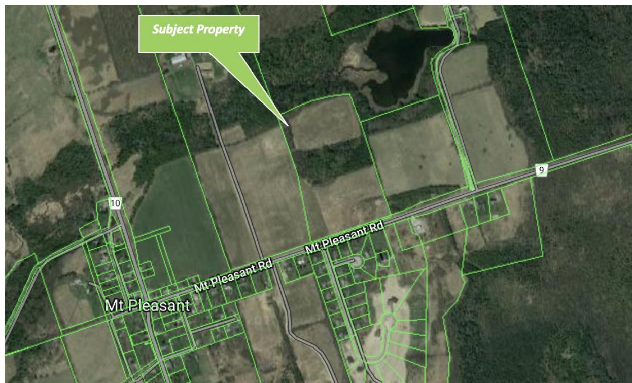
Figure 1 – Proposed tower location on the subject property is outlined in an aerial image below.