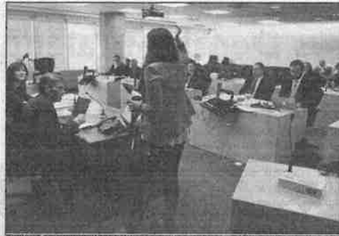
Scene of deliberations on Bay Street to decide on Sumac Ridge appeal