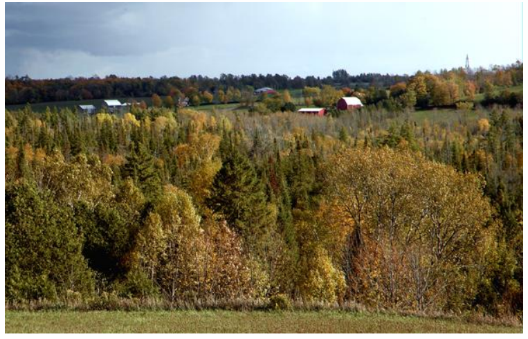
Township Vista