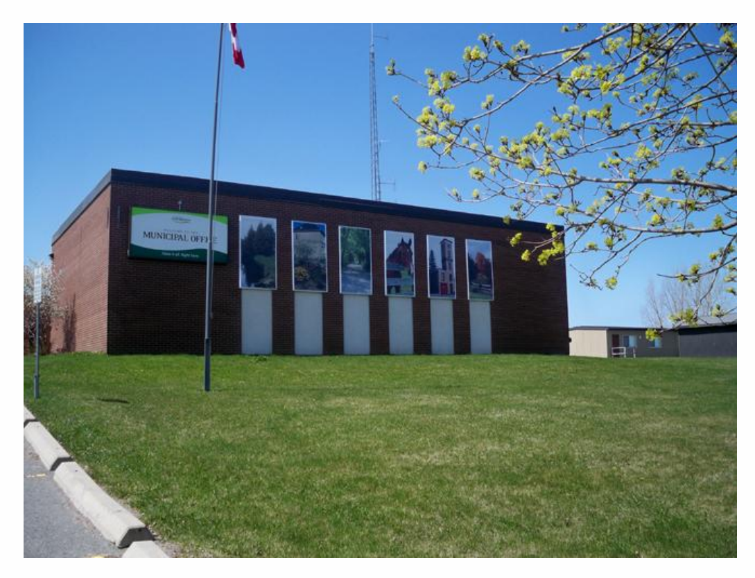
Township of Cavan Monaghan Municipal Office

On the whole, the Township would benefit from a better understanding of the short, medium and long term priorities of each department, particularly regarding the implementation of master plans. While the existing policy framework in Cavan Monaghan provides a solid foundation on which to initiate the strategic planning process, additional planning is still required to ensure the effective implementation of these plans and the rationalization of resources required for this effort. The development and implementation of a corporate strategic plan will assist with this effort.