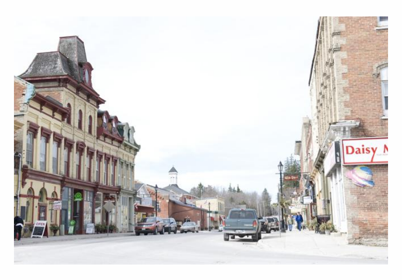
Downtown Millbrook

Ownership of the Millbrook Correctional Facility: While the redevelopment of the Millbrook Correctional Facility has been identified by the community as a priority area for Cavan Monaghan, this site is not under the control of the Municipality as it is owned by the Ontario Realty Corporation. Until the Phase II Environmental Site Assessment (EA)<sup>4</sup> for the property is complete, the Township will have limited influence on the timing of any future use of the site.