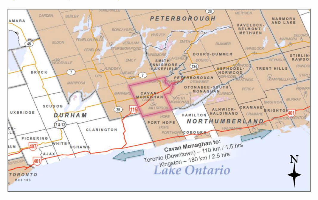
Figure 1: Location Map of Cavan Monaghan